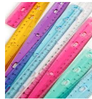
Tape Measure Meters