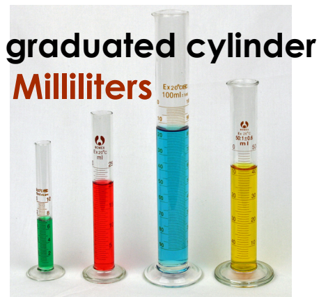
graduated cylinder Milliliters